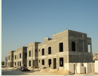
Ongoing Construction of 63 Luxury Villa's in Hamala