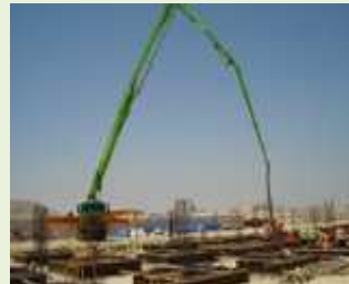
Concrete pouring in the site.

Dream Ready Mix have a well-equipped laboratory, qualified and trained Quality Control Team to check the concrete in the Plant and in the customers site. A daily work procedure was implemented to monitor the quality of the inward materials which are used in the concrete.